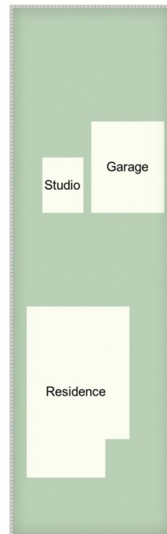
Site Plan Not to Scale