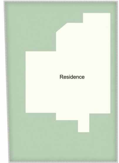
Site Plan Not to Scale